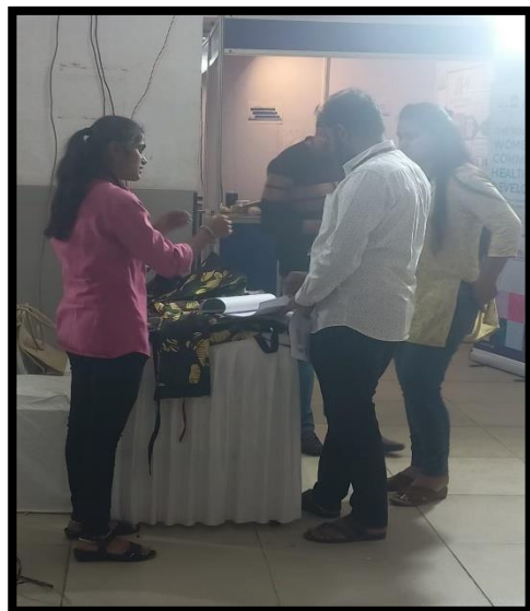
Presentation of Ideas in YUKTI 2023 at DYP University Pune